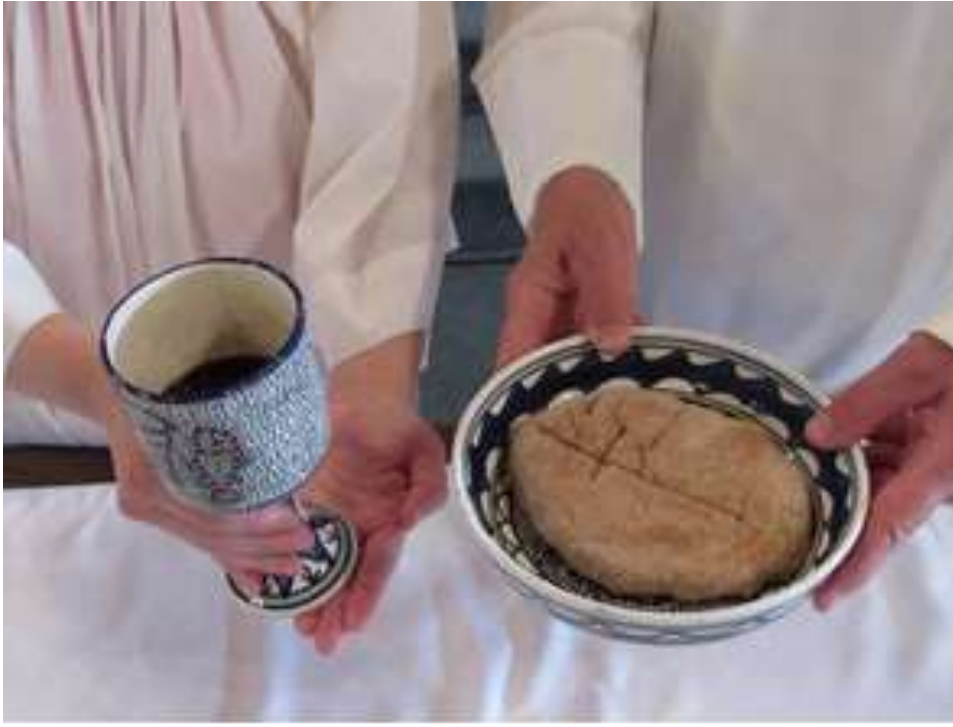
HOLY COMMUNION OFFERED EVERY SUNDAY