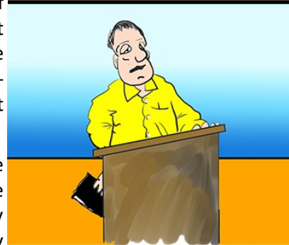
When the sign said "If you park here, you preach today!" I thought it was a joke...

Our fellowship hall, youth rooms, conference room, school rooms and office suite have all moved to different locations since the original building was built. We have changed the pattern of where we do ministry and we have been transformed by worship, prayer, study and discussions shared in the life of our Christian community of faith.