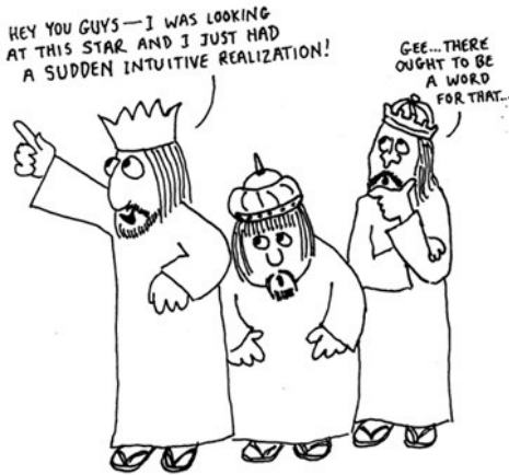
Little-known Epiphany Scene