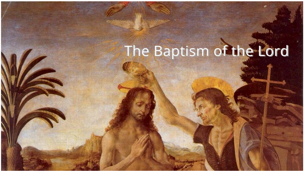
The Baptism of the Lord