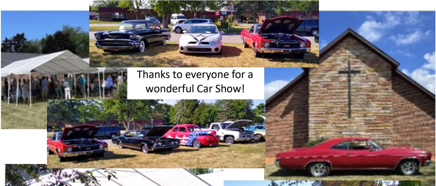
Thanks to everyone for a wonderful Car Show!

We were blessed once more with beautiful weather. All was possible with many volunteers and church committees doing as Jesus has called us to "plant the seeds". Maybe some seeds fell on good soil and helped us, and our neighbors, to build a stronger relationship with our Lord. Perhaps our event will help someone find a new church home. Thank you to all who participated in any way!