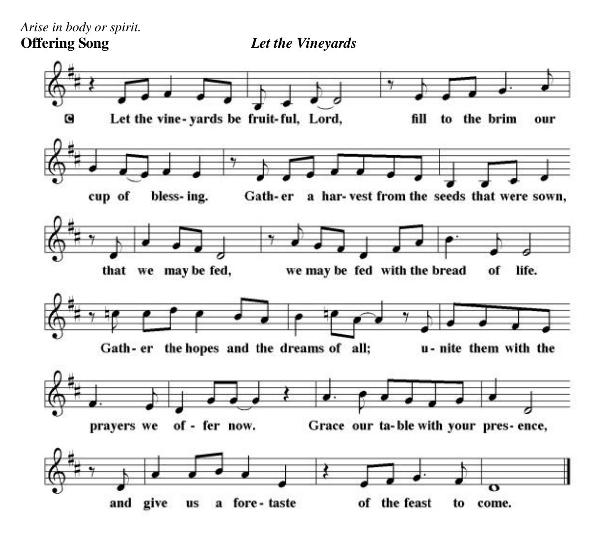
Fifth Sunday of Pentecost - Page 8